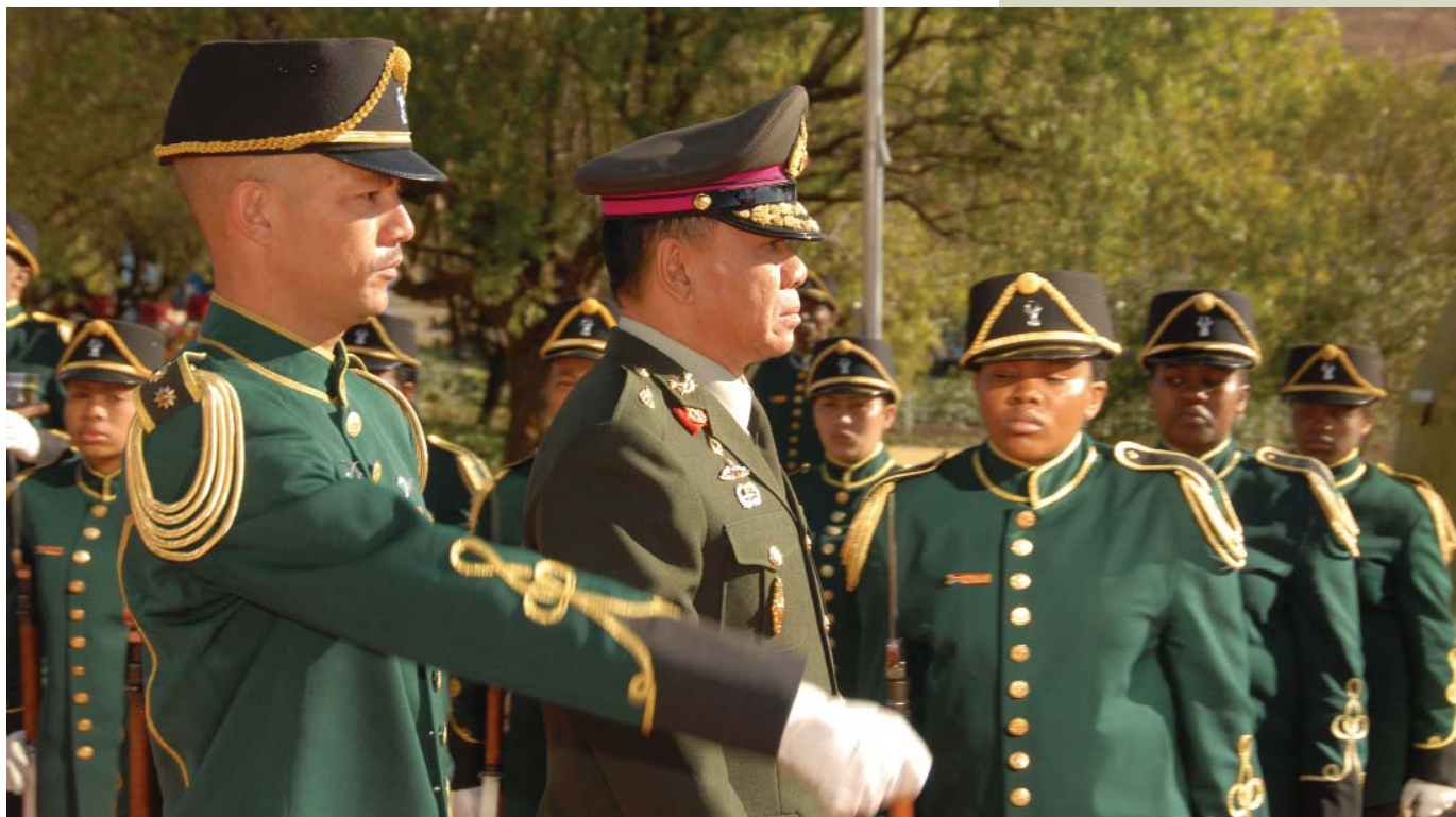
The Chief of the Royal Thai Armed Forces, Gen Song kitti Jaggabatara, (centre) inspects the parade during the Royal Thai Armed Forces visit at the Defence Headquarters on 03 August 2009.