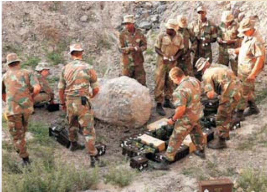
Members of 2 Field Engineer Regiment prepare to demolish a crater.

The open day started with a minute silence in honour of those soldiers of 10 Anti-Aircraft Regiment who died in the training accident on 12 October