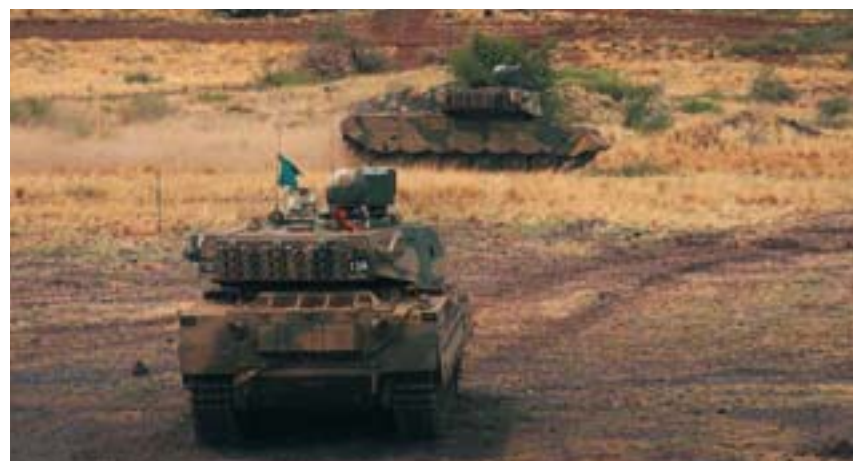
MkII Olifant tanks.