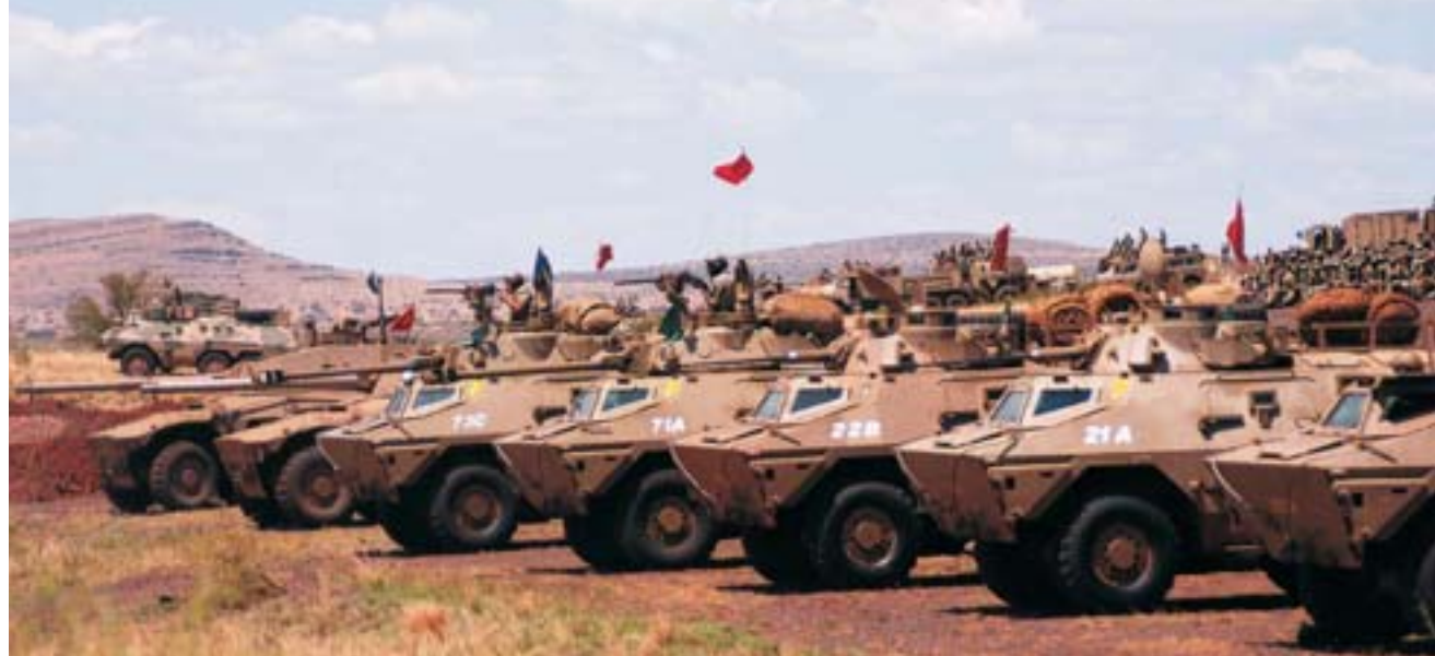
A FIRE DEMONSTRATION: 1 Special Service Battalion with Rooikatte (two Rooikatte: front, left) and 8 SAI Bn with Ratels (front, next to Rooikatte).

(SANDF) after seeing the weapons in action.