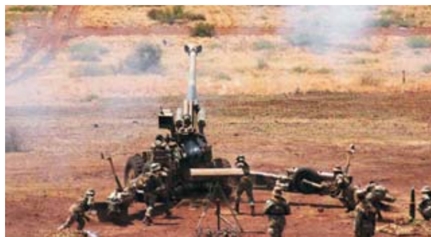
Members of 4 Artillery Regiment demonstrate the firepower of the GV5 - 155 mm gun howitzer - Luiperd.