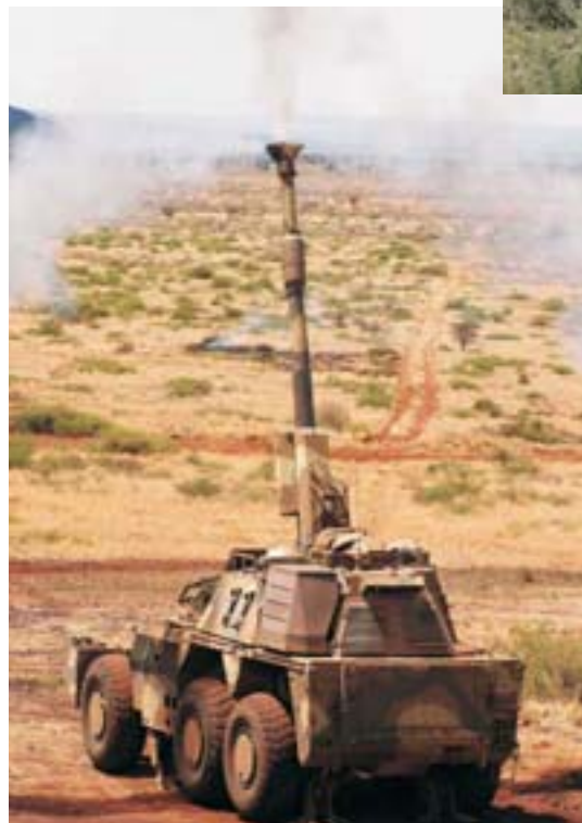
The GV6 - 155 mm self-propelled gun howitzer - Renoster in action.

Comments of the children who attended the day included: "magic, super, impressive". The one girl sat the whole day with her hands on her head, but she never moved her eyes off the weapons. Some of the youngsters indicated that they definitely want to join the SA National Defence Force